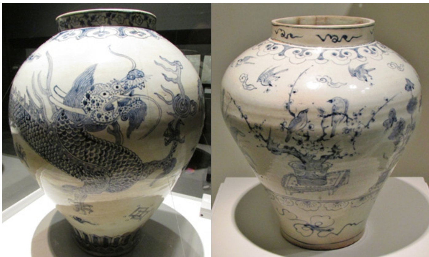
Fig. 3 Underglaze cobalt-blue on white porcelain, (left) Large jar with dragon and cloud design, 18th century, Museum of Oriental Ceramics, Osaka; (right) Jar with plum blossom, bird, and potted plant design, 18th century, Leeum Samsung Museum of Art

of the lives of both aristocrats and commoners who saw in them the harmony of the universe as well as immortality. The crane, deer, and tortoise live long lives; and the rocks, water, sun, and clouds endure forever. Bamboo and evergreen pine stand for strength, yet bend when the wind buffets them. The mythical yongji mushroom gives the elixir of immortality. Motifs favored by the literati include the Four Noble Gentlemen: Pine, Plum Blossom, Bamboo, Orchid (or Chrysanthemum), and landscapes, portraits, animals and other plants.