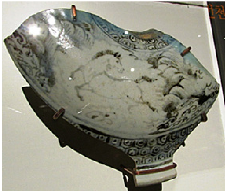
Fig. 1 Underglaze cobalt-blue on white porcelain, (top) Design of "Celestial Flying Horse" Cheonma , 16th century, excavated from kiln site #9 in Beonceheon-ri, Gwangju, Geonggi-do, Seoul Korea National Museum; (bottom) Jar with plum blossom, bird, and bamboo design, 15th - 16th century, National Treasure No. 170, SKNM