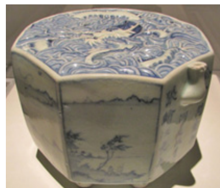
Fig. 2 Underglaze cobalt-blue on white porcelain, (top) Beveled jar with literati painting of flowers, 18th century, Museum of Oriental Ceramics, Osaka; (bottom left) Youngji mushroom and fish design, 19th century, SKNM; (bottom right) Octagonal water dropper with landscape and poem, 19th century, Treasure No. 1329, SKNM

Eventually this rustic style was superseded by a more refined plain white porcelain of great beauty and durability, which in the 15th century was decorated in cobalt blue, giving way to iron brown when the cost of cobalt became exorbitant in the 17th century. The iron-brown work could be highly sophisticated and literary, or even carefree and humorous. Copper red decorations, mainly from the 18th century, were more unusual and difficult to make and can dazzle us with their color and freshness. The Saongwon ministry in charge of royal cuisine ordered production of white vessels at the Bunwon official kiln in Gwangju, Gyeonggi Province (just outside Seoul), where court painters were sent to decorate the now famous Joseon blue and white. The cham-