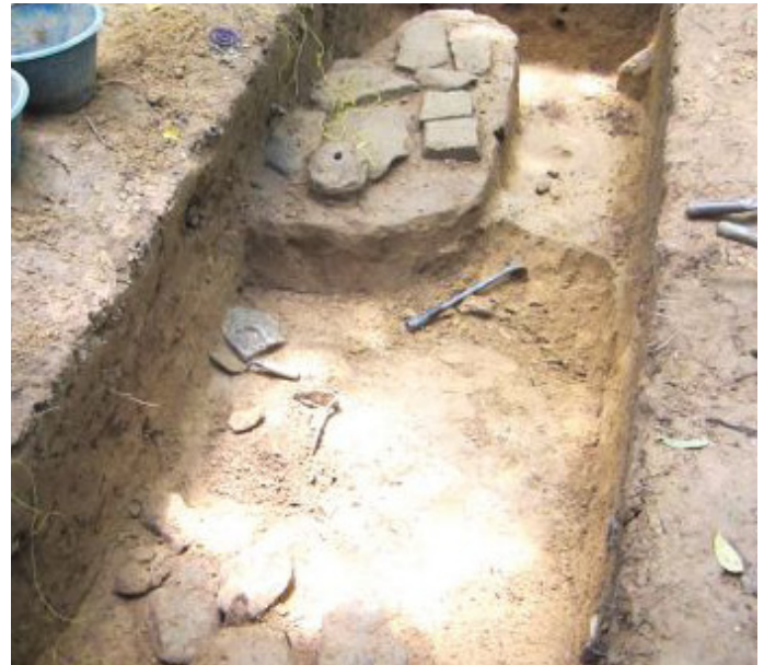
Fig. 1 Pieces of sandstone that researchers think might have been used for a house mound discovered during a 2013 excavation