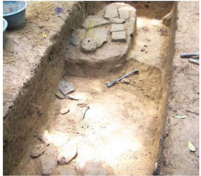
Fig. 1 Pieces of sandstone that researchers think might have been used for a house mound discovered during a 2013 excavation