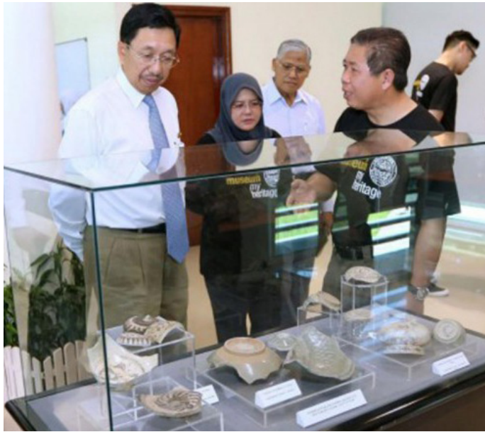
Fig. 1 500 year old Sukhothai wares also on the display

Members of the public can now learn about the history of 700 year old artefacts that were left behind from the ancient city of Kota Batu at the newly-launched Archaeological Park. The 120 acre park has an exhibition that showcases ancient objects found at Kota Batu archaeological site around 1950. The exhibited artefacts include stone carvings, pottery, ceramics and ancient coins. A 2.9 kilometer walkway was also built at the park for sightseeing.