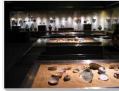
The displays seen here show (upper left) a variety of storage jars (upper right) an outline chronology for Thai trade ceramics (forefront, lower right) the mixture of Thai, Chinese and Vietnamese ceramics made about AD 1380-1430.

The Southeast Asian Ceramics Museum is located at the Rangsit campus of Bangkok University.